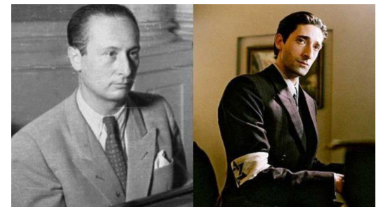
Władysław Szpilman of the movie "The Pianist" was aided by 40 Poles.