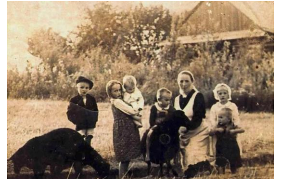
The entire Ulma family was executed for aiding Jews.