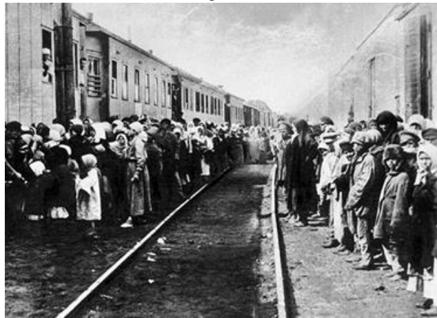
Soviet mass deportations of Poles to the gulags and slave labor camps

Executed 22,000 Polish officers at Katyn