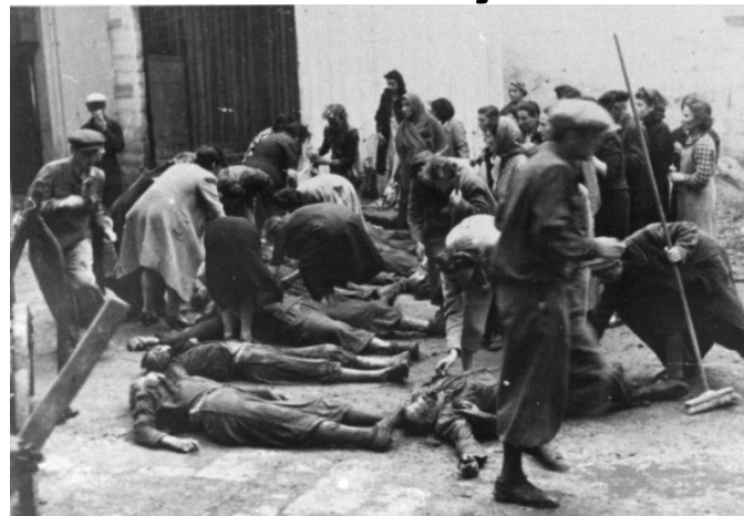
Poles identify relatives executed by the Soviets before the Soviets fled from the advancing Germans.