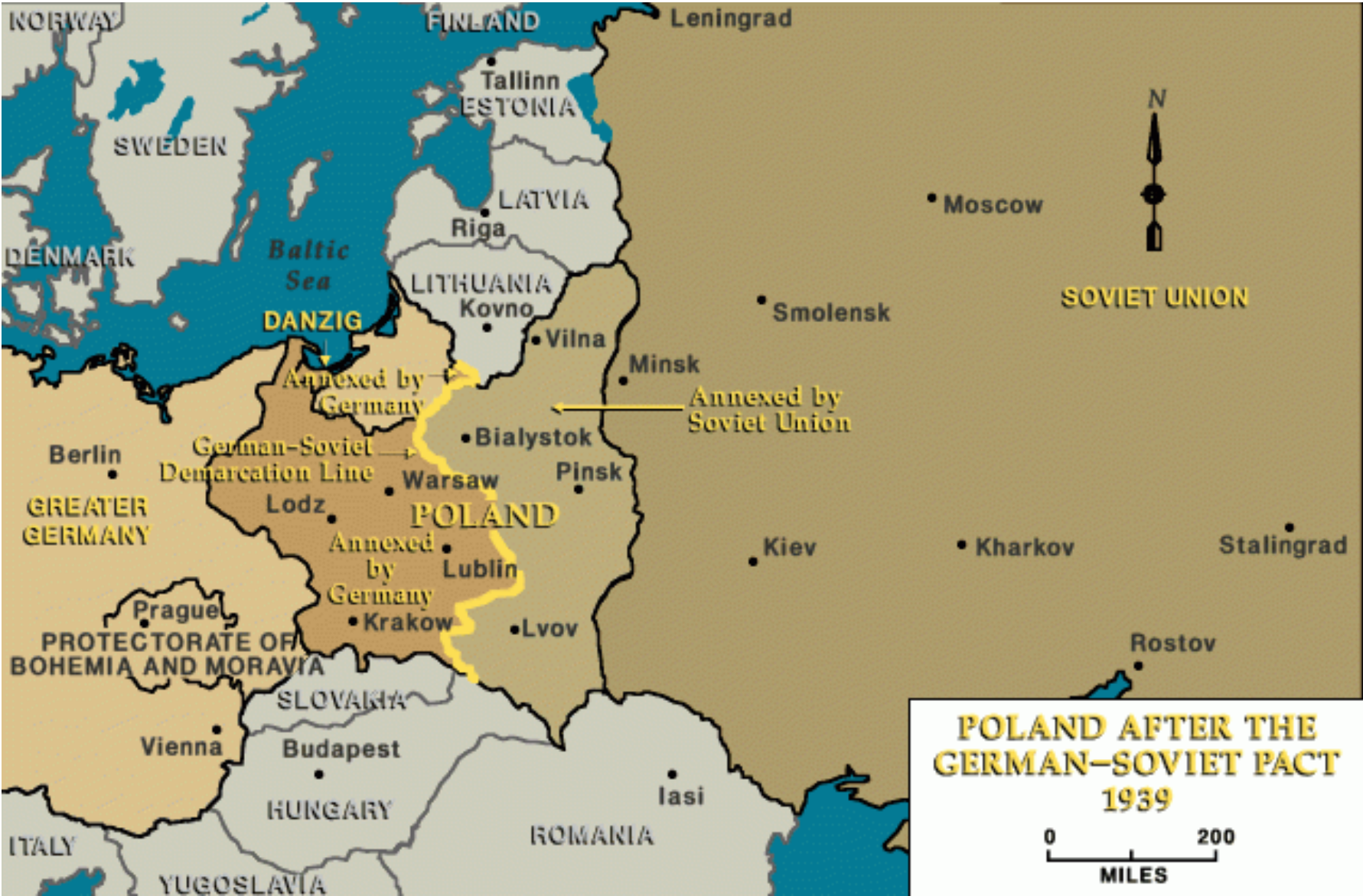
Having been annexed by Hitler and Stalin, Poland ceased to exist as a nation state.