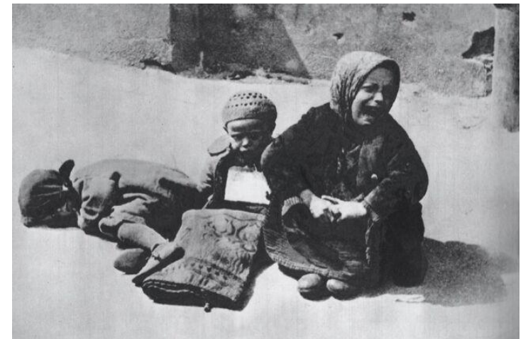
Homeless children in Warsaw Ghetto