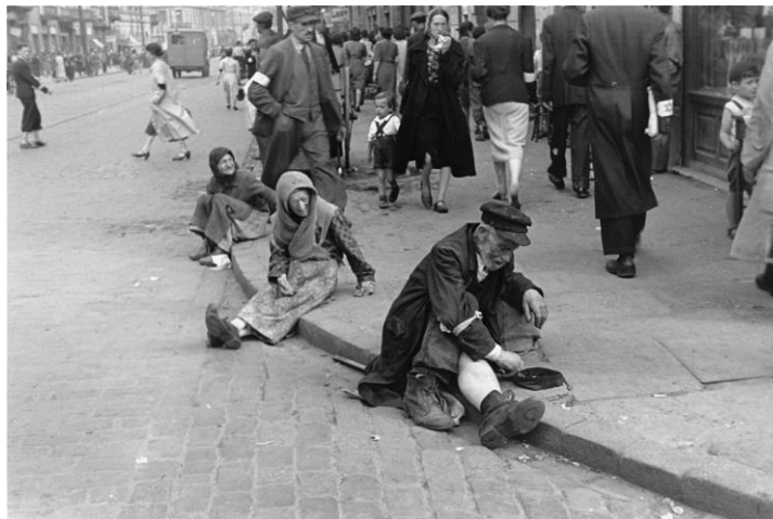
Destitute Jews in Warsaw Ghetto