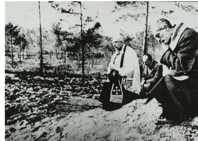
Priests perform Mass for Polish officers executed at Katyn.